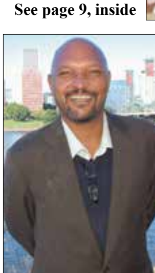
Stop the Violence

Incoming commissioner says King's message more important than ever See page 4, inside