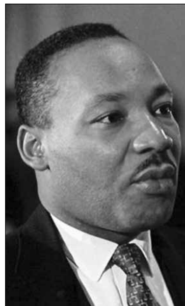
Rev. Martin Luther King Jr.

The 36th annual event will be a virtual event because of the public health restrictions on large gatherings that have resulted from the coronavirus pandemic. It will stream live on the Martin Luther King Jr. Holiday, Monday, Jan. 18, from noon to 5 p.m. on multiple