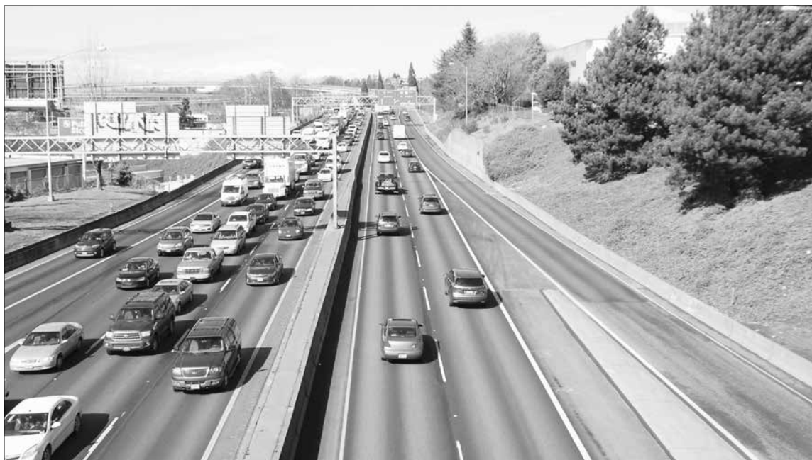
The Oregon Department of Transportation is moving to elevate Black voices to shape the controversial I-5 Rose Quarter Improvement Project.