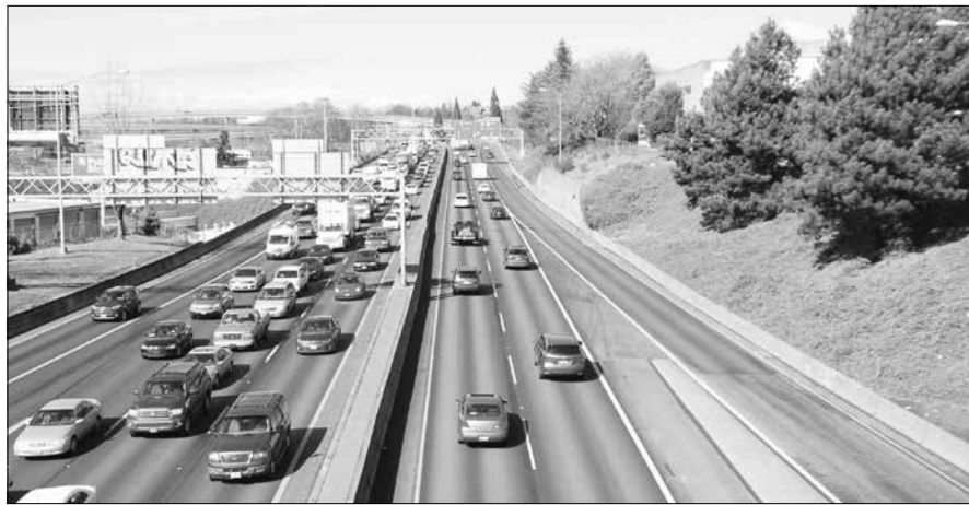
The I-5 Rose Quarter Improvement Project moves ahead, despite objections it doesn't do enough to restore justice to the black community which was displaced by the freeway when it was constructed six decades ago.