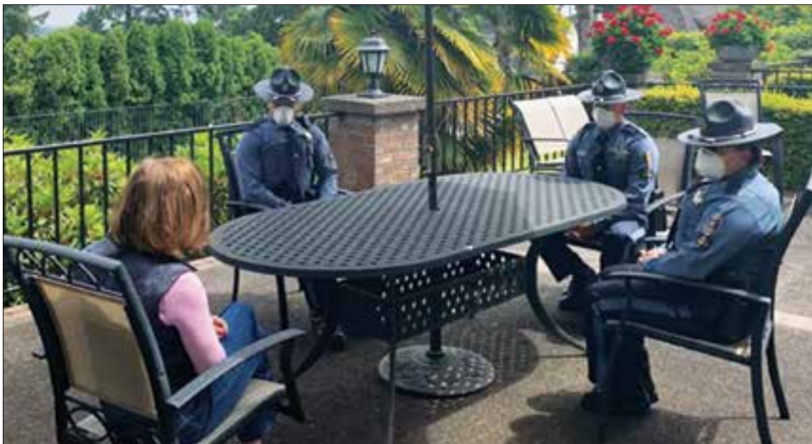
Gov. Kate Brown sat down with masked Oregon State troopers Friday who just two days earlier went into a Corvallis coffee shop without face coverings despite her statewide order to wear masks to prevent spreading the coronavirus. After Friday's meeting, Brown said the troopers pledged to do better and she didn't want to judge or fire anybody over one mistake.