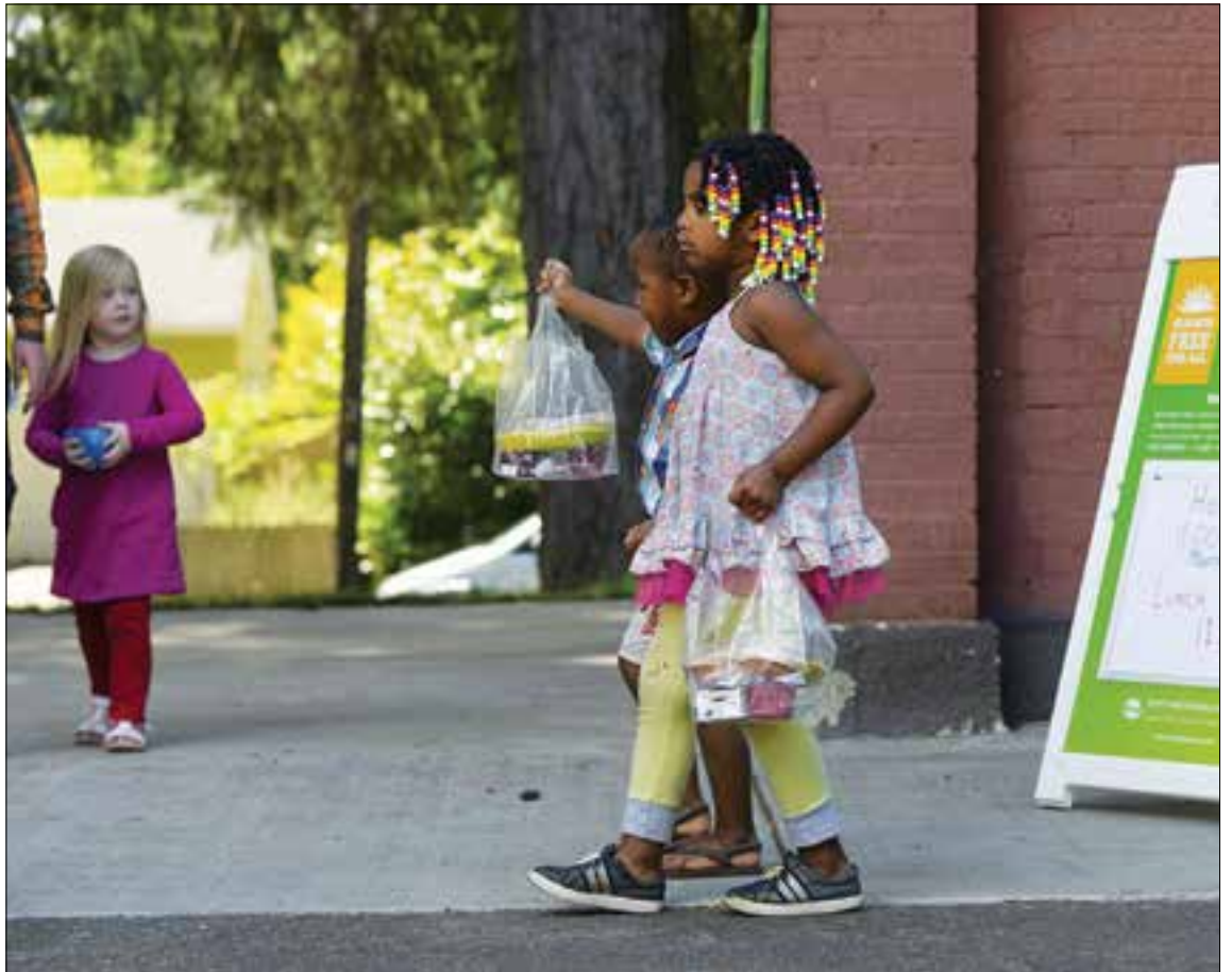
Portland Parks & Recreation's Free Lunch + Play program returns Monday with the distribution of free meals for kids at several parks and some apartment complexes, citywide. The program has been expanded to provide food security in the wake of the COVID-19 pandemic.