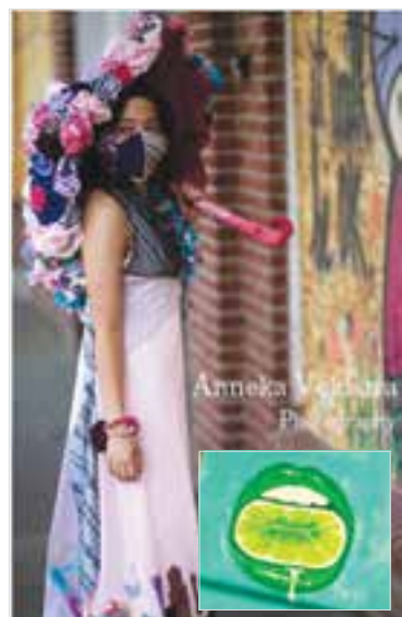
Anneka Root is an aspiring photographer. This is an example of her work.