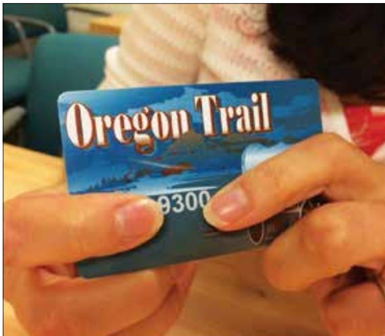
Families with children who are eligible for free or reduced-price school meals will now be getting cash benefits applied to EPT cards for the meals they would have received at schools that are closed because of the coronavirus pandemic.

Oregon families with children who are eligible for free or reduced-price school meals will get the cash benefits for the meals they would have received