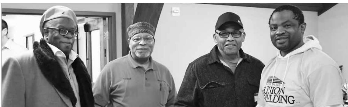
Portland Community College hosts a meeting for minority, women, emerging small businesses and veteran-owned firms. Coming Wednesday, Feb. 26 at 6 p.m. will be another event to recruit participation in campus construction projects to be held on the Sylvania Campus