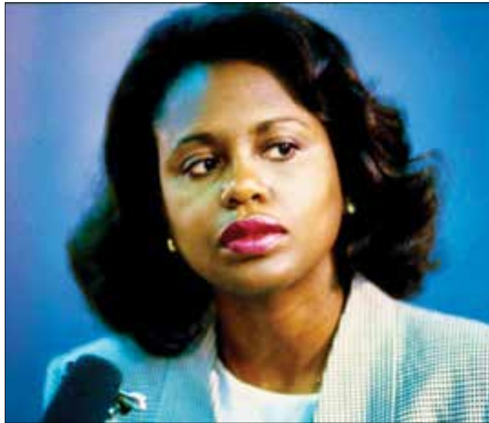
Lawyer and academic Anita Hill in 1991 when she accused U.S. Supreme Court nominee Clarence Thomas, her supervisor at the Department of Education and the Equal Employment Opportunity Commission, of sexual harassment.