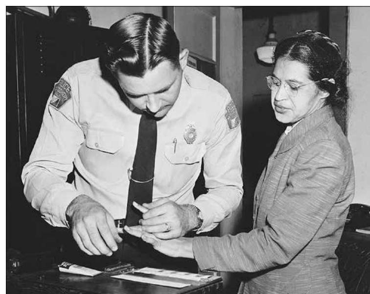
Rosa Parks, as she was fingerprinted by police during the Montgomery Bus Boycott, 1956.

Environmental Justice organization also declared Feb. 4 as Transit Equity Day in honor of Parks, joining representatives of the NAACP, the Urban League of Portland and Bus Riders Unite, in support of the designation and the “fare-free transit holiday” on TriMet starting in 2021.