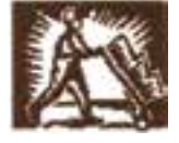
Scrapping Metal & Landscape Maintenance