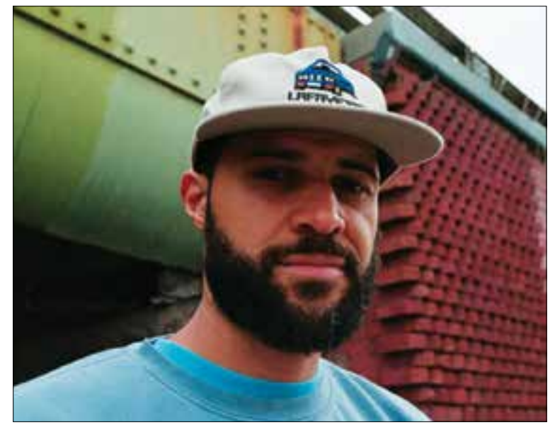
New York-based rapper Homeboy Sandman will perform Sunday, Feb. 2 at Mississippi Studios.

WSU Vancouver is located at 14204 N.E. Salmon Creek Ave.. east of the 134th Street exit from either I-5 or I-205.