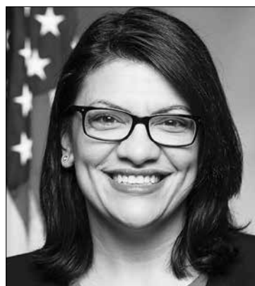
U.S. Rep. Rashida Tlaib

Rep. Earl Blumenauer, Portland's representative in Congress, is bringing Tlaib to Jefferson High School in north Portland to hold an open forum to discuss solutions for the country's most vexing housing challenges. It will begin at 1:30 p.m., Jan. 25 in the Jeffer-