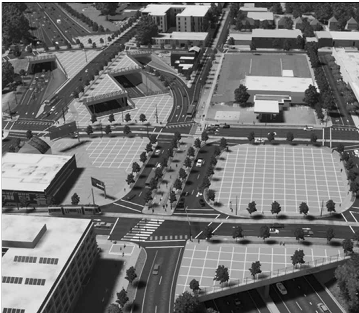
An artist's rendering shows proposed caps over I-5 in the Rose Quarter area that could only support a park or plaza. The Oregon Department of Transportation will now consider making the caps suitable to hold buildings after complaints by advocates for the African American community who want buildable lots to restore historic displacement going back decades.