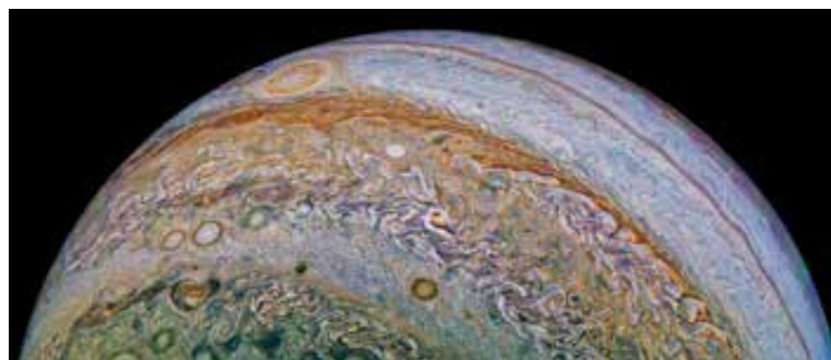
NASA's Juno spacecraft is giving us the first detailed images of Jupiter's complex cloud structure, beautiful images of the circles and swirls from intense storms that extend hundreds of miles deep.

Tickets are $29 in advance or $32 at the door, with senior tickets $25 in advance and $30 at the door, and student and veteran tickets $20 in advance or $25 at the door. Call 503-236-7253 or visit milagro.org .