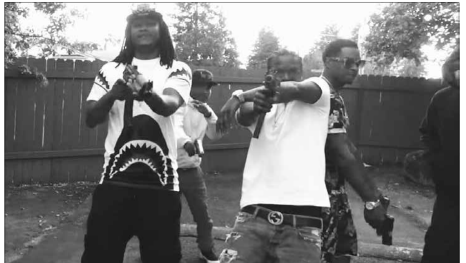
A music video posted to Youtube that glorified firearms was investigated by Homeland Security and led to the arrest of two Portland men for illegal possession of a firearm.