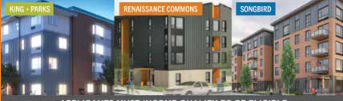
APPLICANTS MUST INCOME QUALIFY TO BE ELIGIBLE

CONTACT US Monday, Wednesday, Friday from 9-11AM and 1-5PM Email: phowartist@portiandoregon.gov | Phone: (503) 823-4147