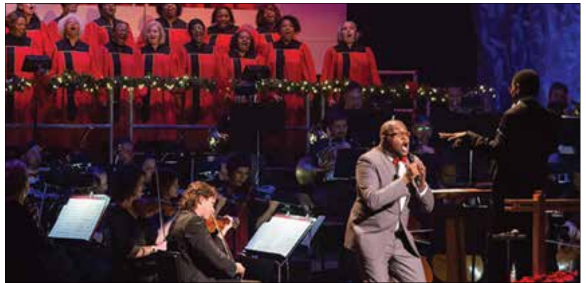
The Oregon Symphony's annual Gospel Christmas show features premier gospel singers and the Northwest Community Gospel Chorus. A free and open-to-the-public sneak preview of this year's show will take place Saturday, Dec. 7 at noon at Maranatha Church of God, 4222 N.E. 12th Ave.