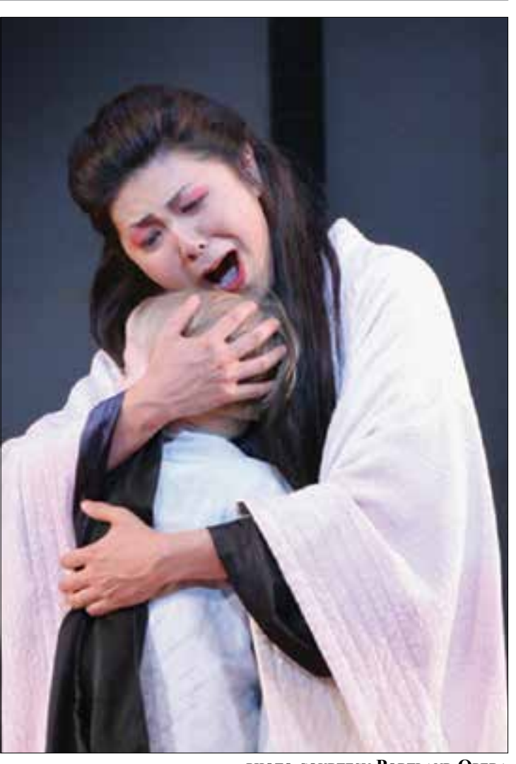
Internationally acclaimed soprano Hiromi Umura in the title role of Portland Opera's "Madama Butterfly."

"Madama Butterfly" has four performances, Oct. 25, Oct. 26, Oct. 31 and Nov. 2. For more information, and to purchase tickets, visit portlandopera.org or call 503-241-1802.