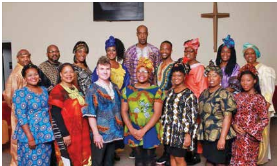
Portland's African American PassinArt theater group assembled for a previous year's production of Black Nativity. Community members interested in participating in this year's production are encouraged to contact the organization or attend volunteer training sessions on Oct. 19 and 26.