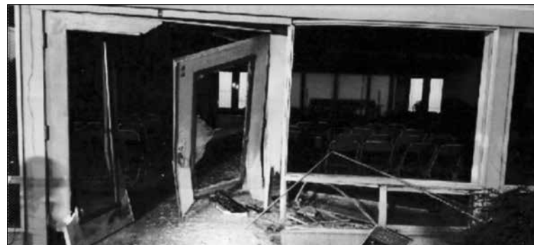
A photo shows some of the damage to Our Lady of Lavange Church at 5404 N.E. Alameda after a disgruntled man drove his SUV into the church on the day before Christmas last year. The driver was sentenced Friday to probation.