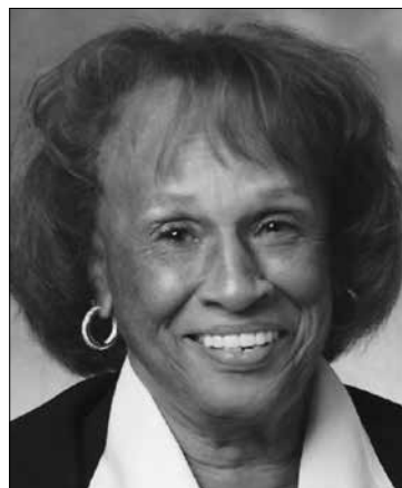
Sen. Jackie Winters

Sen. Winters, the only black Republican in the Oregon Legislature, impacted thousands of people's lives during her lifetime, providing them with hope and a future through her legislative ad-