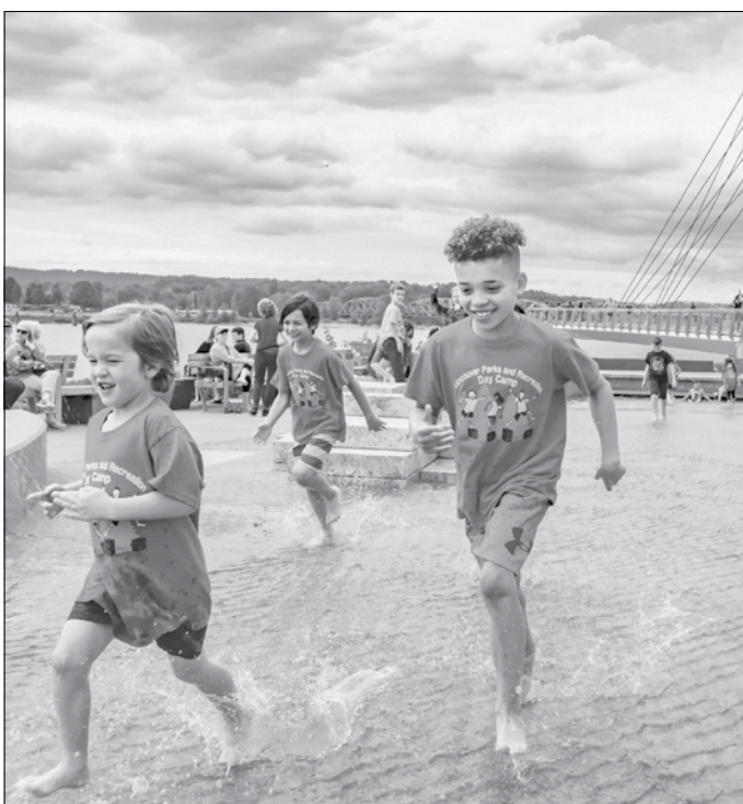
Day campers from Vancouver Parks and Recreation play in the new water feature at Vancouver Waterfront Park, in downtown Vancouver.

Water cascades down it in a variable flow, reflecting seasonal changes in the flow of the river. The water is chlorinated and can be waded through and played in by visitors.