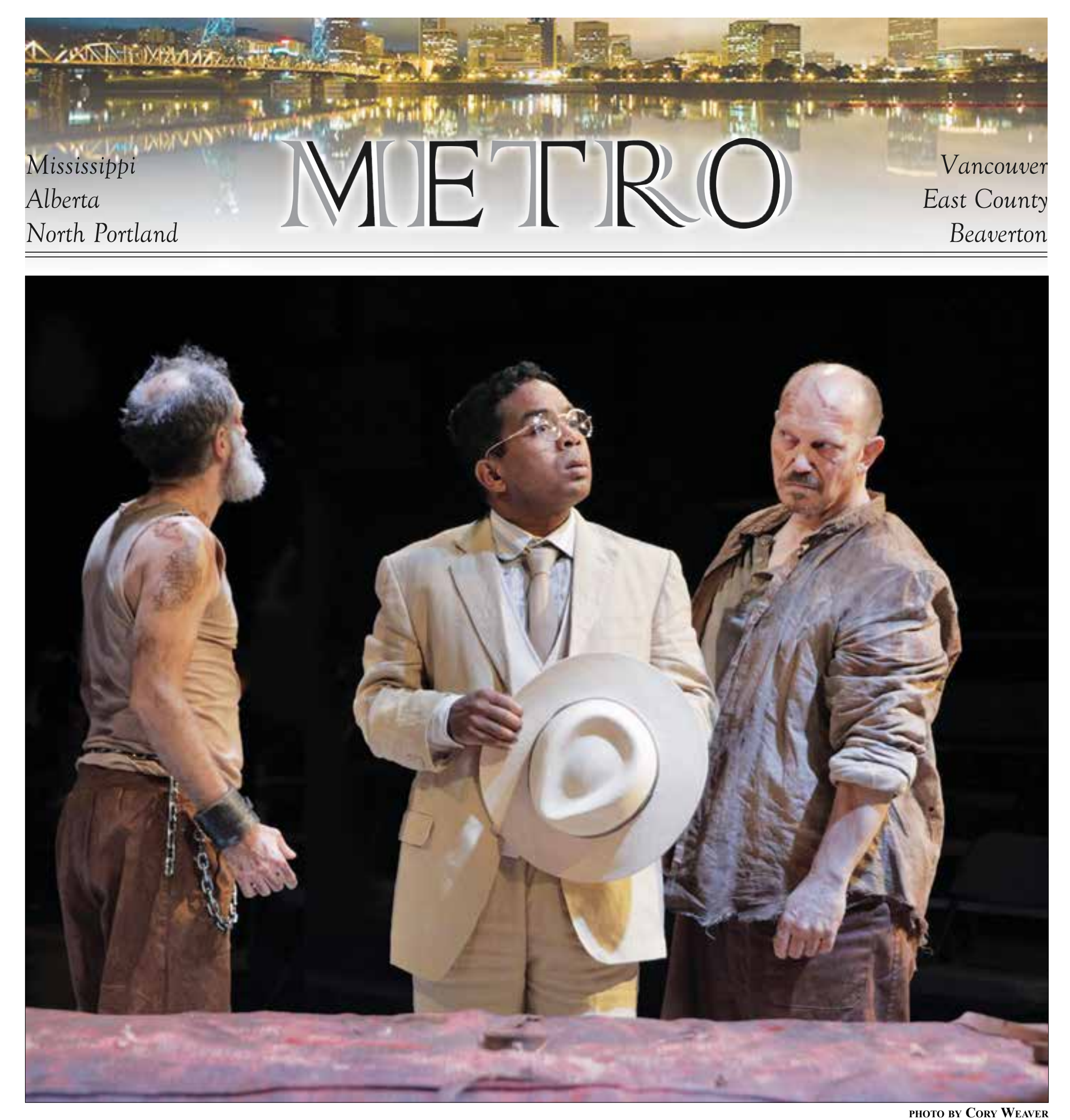
The Portland Opera presents "In the Penal Colony,' a play that exposes a nightmarish machine of executions. Now playing through Saturday, Aug. 10.

A piercing and profound view of justice and change is behind the Portland Opera's presentation of "In the Penal Colony," a play about a man who is invited to visit a penal colony to observe the execution of a condemned man at the hands of a nightmarish machine.