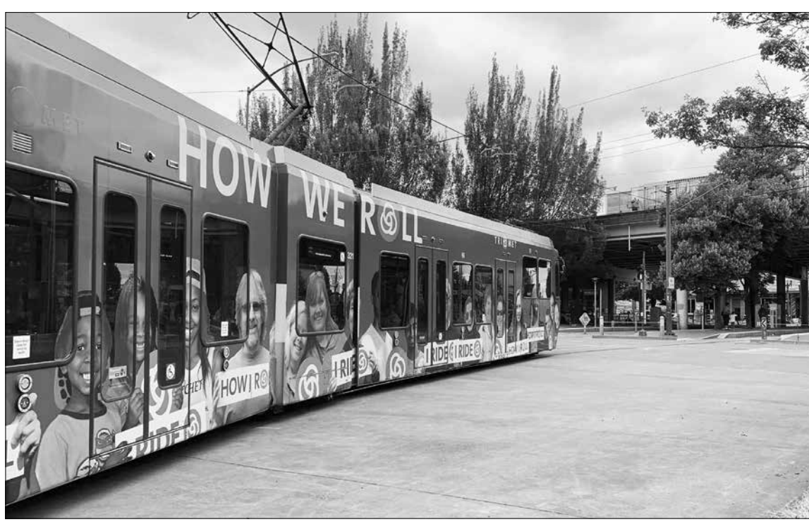
Nearly two weeks of disruptions for the Blue, Green and Red Lines on TriMet's Max system, between the Rose Quarter and Lloyd areas, starts Thursday as the agency makes track improvements.