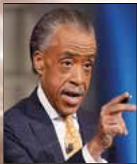
Rev. Al Sharpton 10am - 1pm

Listen Live At Portlandmedium.com (Click On KBMS icon)