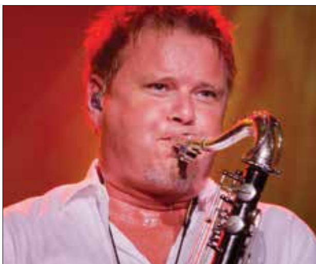
Smooth jazz saxophonist Euge Groove.

But Vanport wasn't built to last. On Memorial Day, 1948, the Columbia River broke through the nearby levees, unleashing a historic flood that displaced 18,000 people from their homes—a quarter of whom were African American. The Vanport Flood was, in the words of a former resident, the Hurricane Katrina of its time.