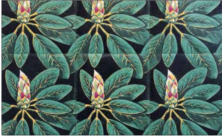
Gail Owen creates linoleum relief prints that are hand sewn together.