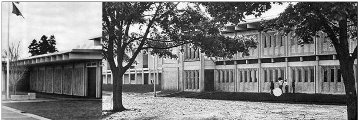
A historic photo shows the former and short lived John Adams High School near Northeast 42nd and Killingsworth. A two-event all-class reunion for all alumni, former faculty and staff will take place this summer.

Bus service to popular Columbia Gorge locations begins its fourth summer season. The Oregon Department of Transportation bus now operates year-round, but started its expanded summer schedule this month with eight departures a day from the Gateway Transit Center to Rooster Rock State Park and Multnomah Falls. Gorge visitors can reach the Columbia Gorge Express from anywhere on the TriMet system. For more information, go to Columbiagorgeexpress.com .