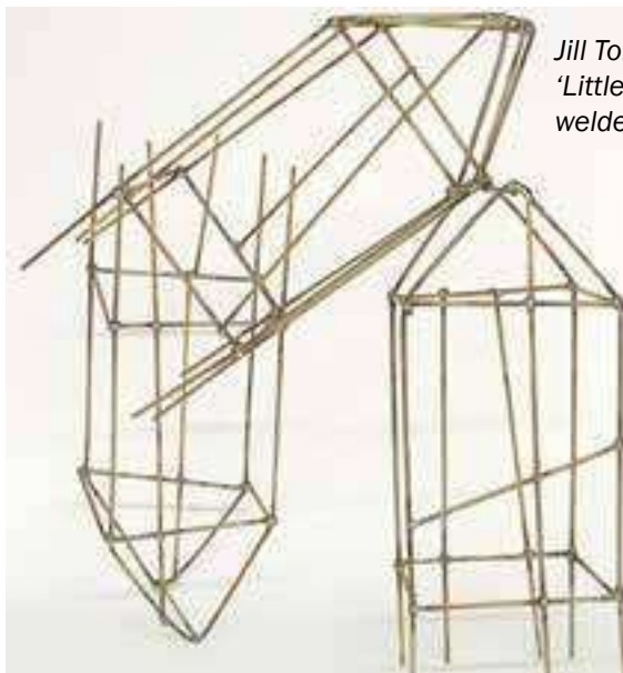
Jill Torberson's 'Little Boxes' of welded steel.

For more information and to buy tickets/tables, call 503 287-4922 or visit nxneclinic.ejoinme.org/CommunitySupper2019