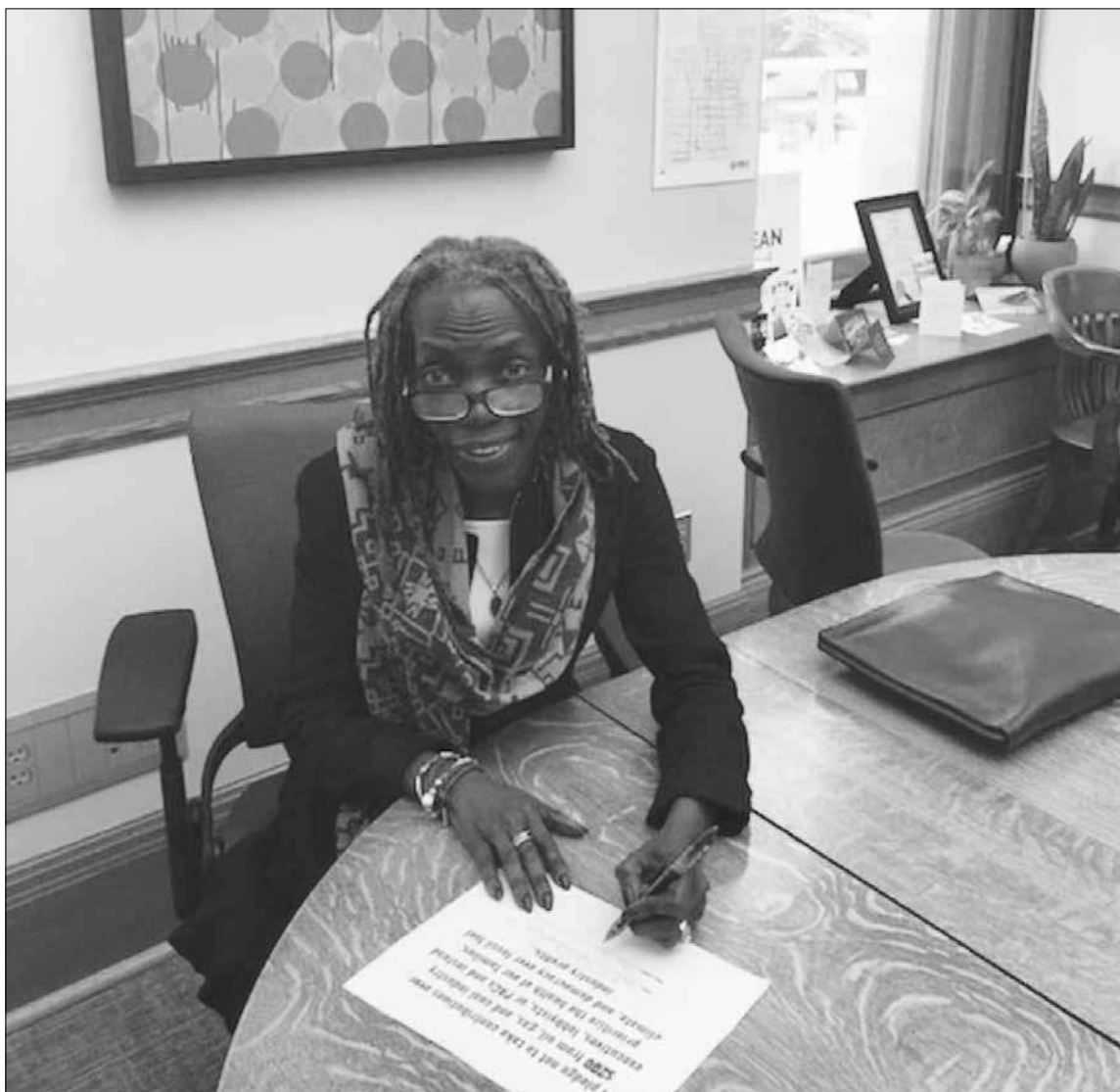
Portland City Commissioner Jo Ann Hardesty signs a 'No Fossil Fuel Money Pledge.'