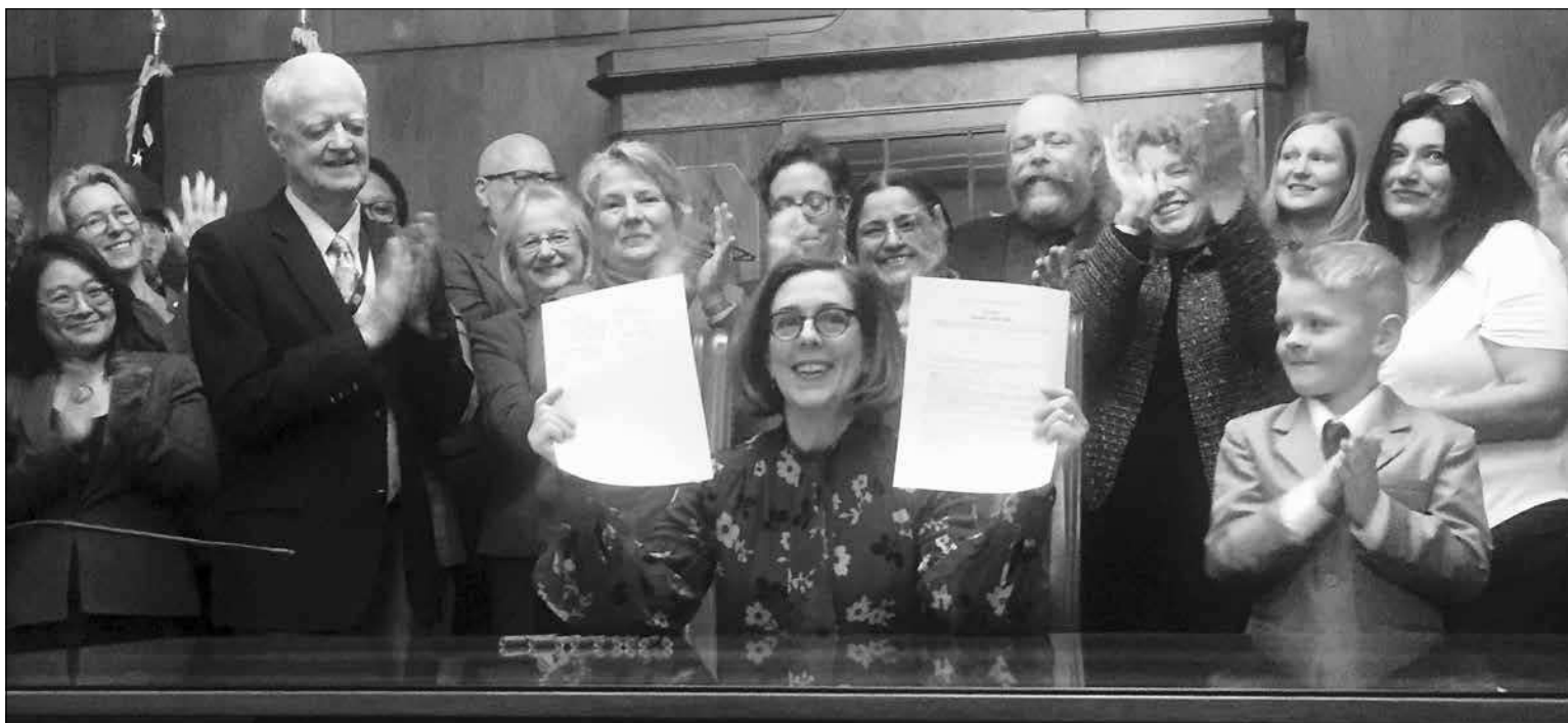
Oregon Gov. Kate Brown holds a ceremony Thursday to sign a rent control law at the State Capitol in Salem. The bill is meant to address a housing crisis that has touched every corner of the state.

area, the average rental unit costs about $1,400 a month, according to data released by the city. Oregon is also suffering from a lack of affordable housing and has one of the highest rates of homelessness in the country.