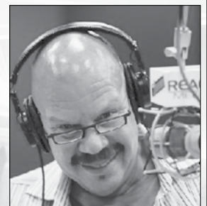
Tom Joyner 3am - 7am

KBMS Radio 1480 AM Portland's best music station