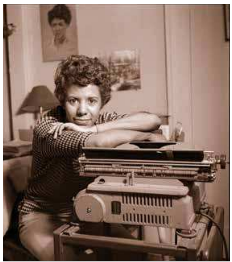
A free screening of the documentary 'Lorraine Hansberry: Sighted Eyes/Feeling Heart' at Reed College on Monday, March 11 will commemorate the 60th anniversary of the premiere of Hansberry's landmark play 'A Raisin in the Sun.'