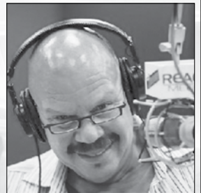
Tom Joyner 3am - 7am

KBMS Radio 1480 AM Portland's best music station