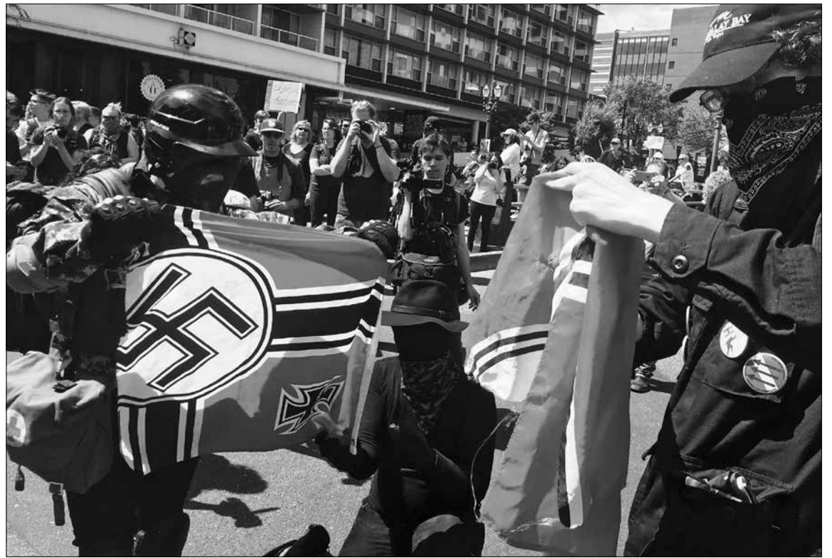
Counter protesters tear a Nazi flag during a demonstration downtown in this Aug. 4, 2018 file photo.

This page Sponsored by: Fred Meyer What's on your list today?.