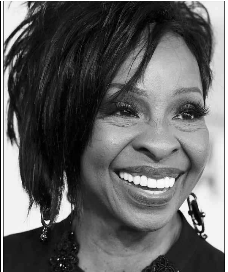
Gladys Knight will sing the National Anthem for the Super Bowl on Feb. 3 in her hometown of Atlanta.

Fax: 503-288-0015 e-mail: classifieds@portlandobserver.com The Portland Observer