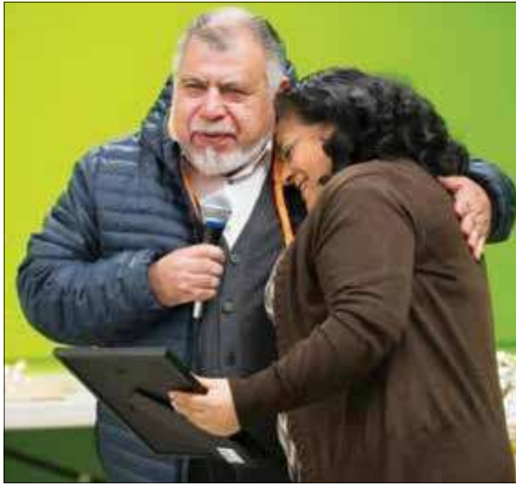
Parents hug each other at the launch of the Parent Handbook, a 48-page resource for parents with children in the criminal justice system.

"It is great for parents to have what they need," Multnomah County Circuit Court Judge Nan Waller said. "But it's really our