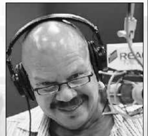
Tom Joyner 3am - 7am

KBMS Radio 1480 AM Portland's best music station