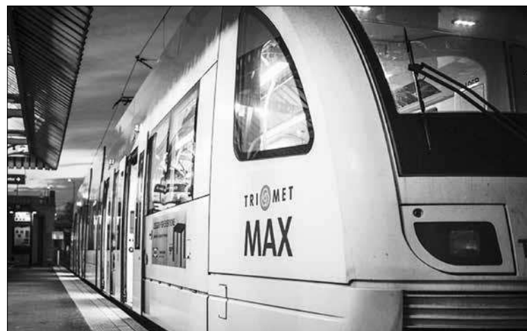
TriMet will offer rides for free for New Year's Eve, Monday, Dec. 31 beginning at 8 p.m. through 3 a.m. on Jan. 1.

To take advantage of the free New Year's Eve service, just remember, after 8 p.m., there's no need to tap your Hop card or buy a ticket at the station. Just hop on any Trimet bus, MAX train or