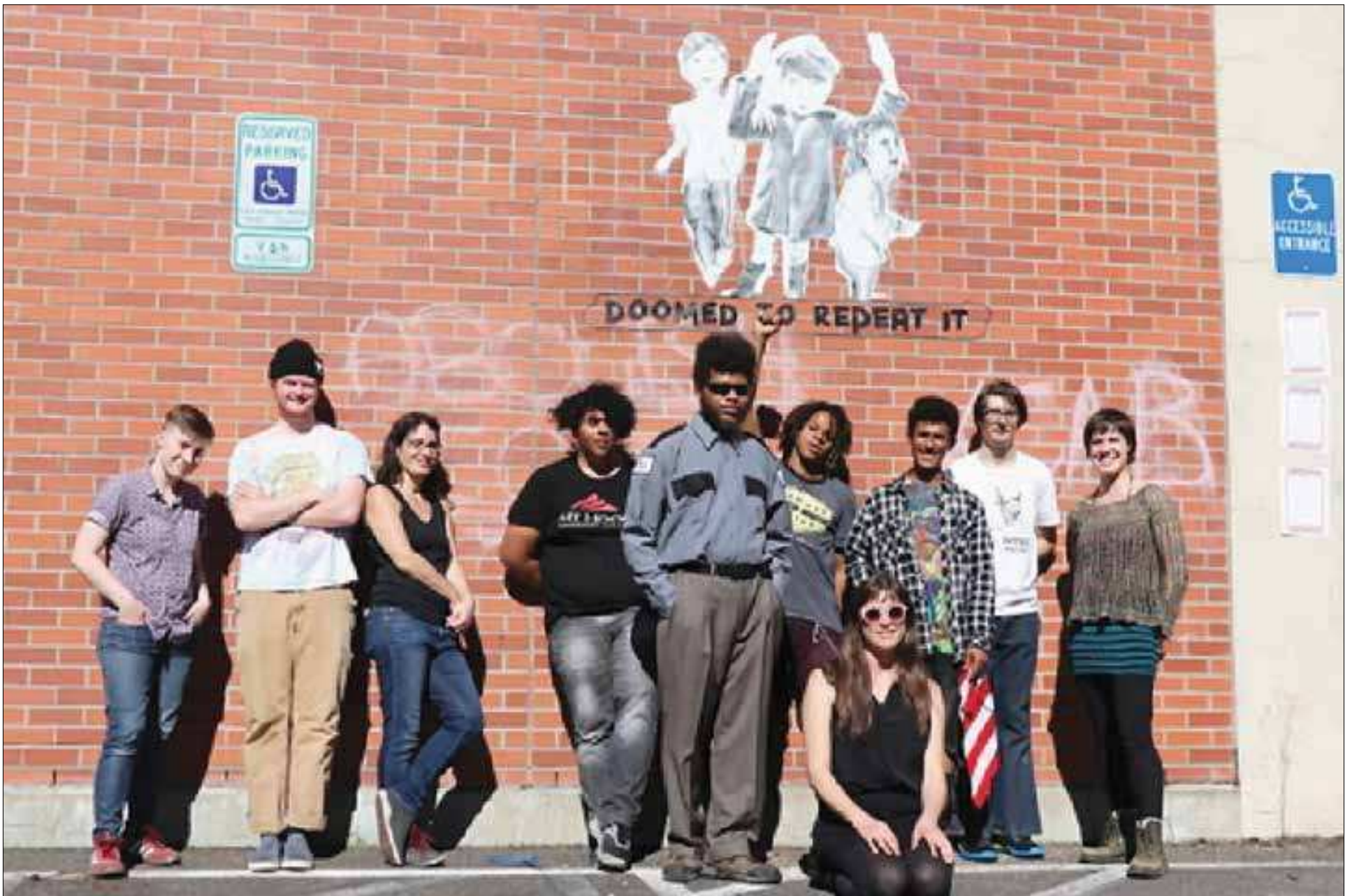
The cast and crew of "Doomed to Repeat," a film by homeless youth about art, activism and the federal Immigration and Customs Enforcement (ICE) agency.

From Our Family to Yours Happy Hollidays