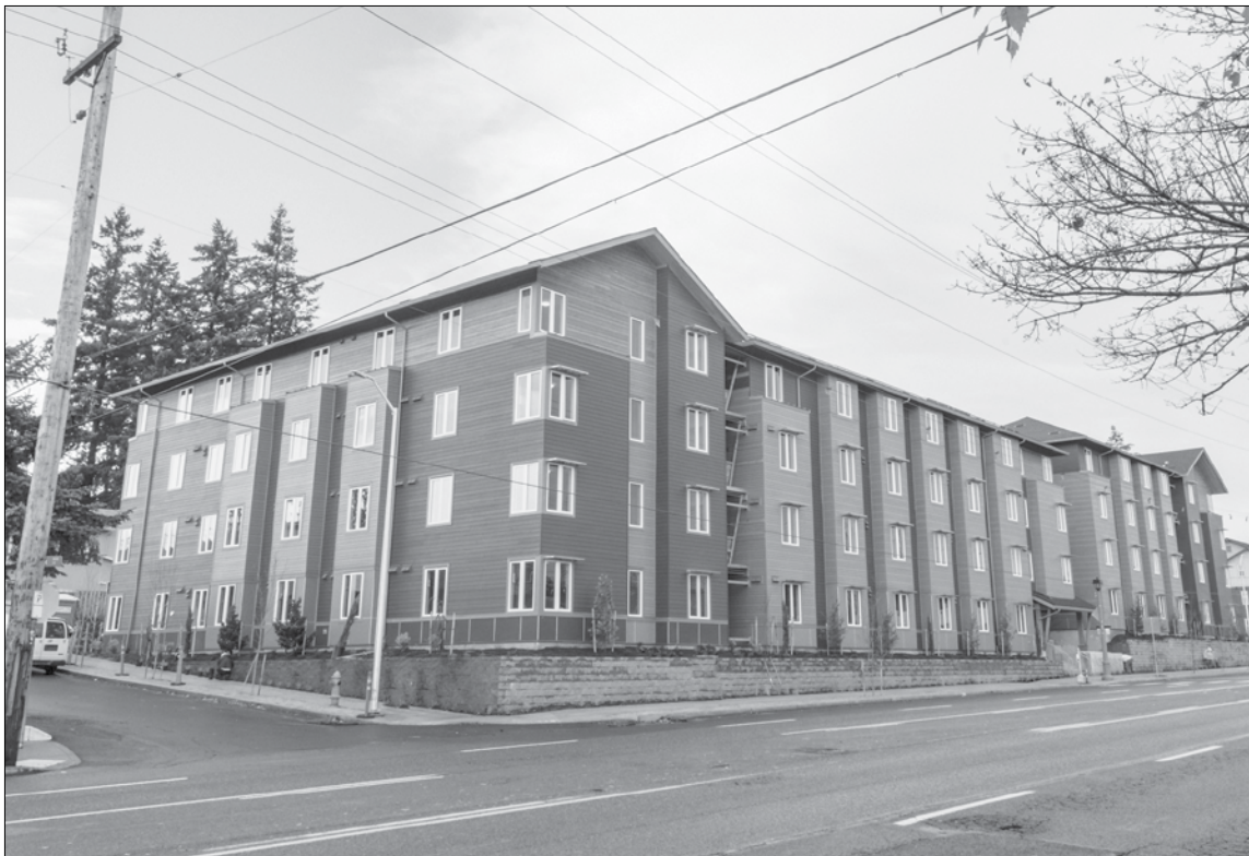
Hazel Heights is a new affordable housing complex that will be home to 153 households on Southeast Stark Street at 126th Avenue.