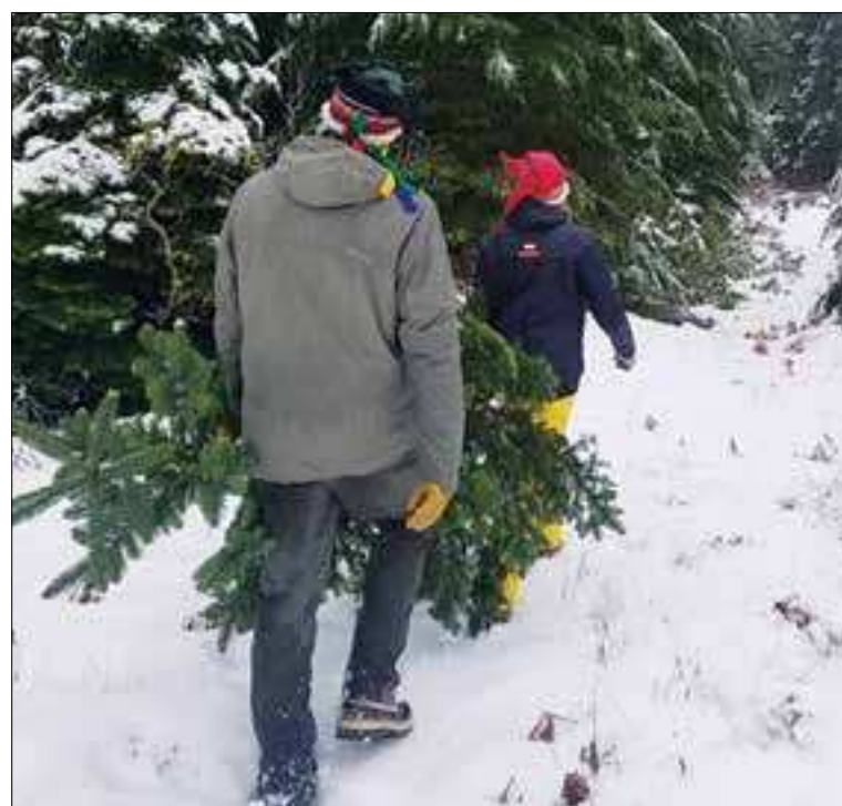
A permit allows National Forest visitors to harvest a Christmas tree from designated areas. Personal use Christmas tree cutting permits for $5 are now available at National Forest offices and from local vendors.

Tree cutting and travel may take longer than anticipated, so you're advised to let a friend or family member know where you're going, get an early start, and leave the woods well before dark.