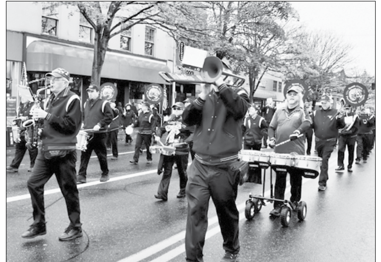
The Veterans Day Parade along Northeast Sandy Boulevard in the Hollywood District draws support from the community. This year's parade is scheduled for Monday, Nov. 12 beginning at 9:30 a.m. at Northeast 40th and Tillamook.