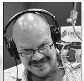
Tom Joyner 3am - 7am

KBMS Radio 1480 AM Portland's best music station