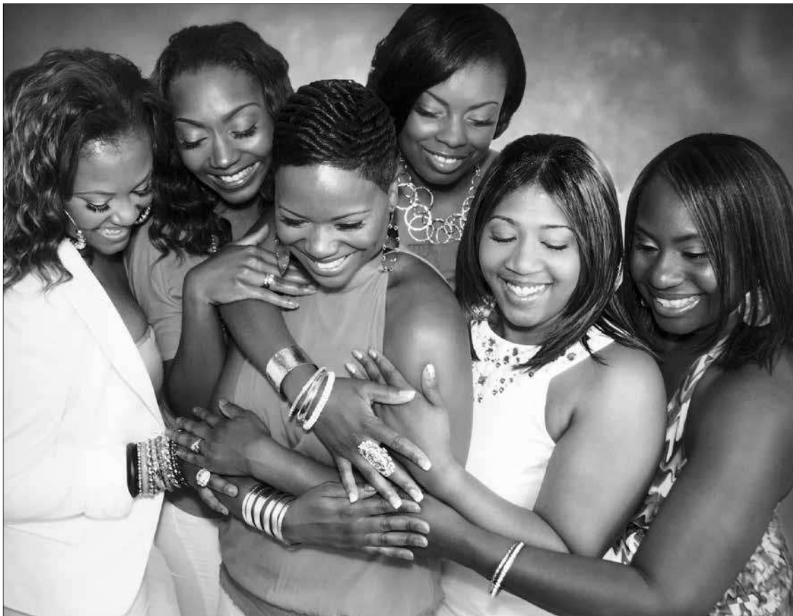
The African American women's support group "Sisterhood" is building new connections in the community.