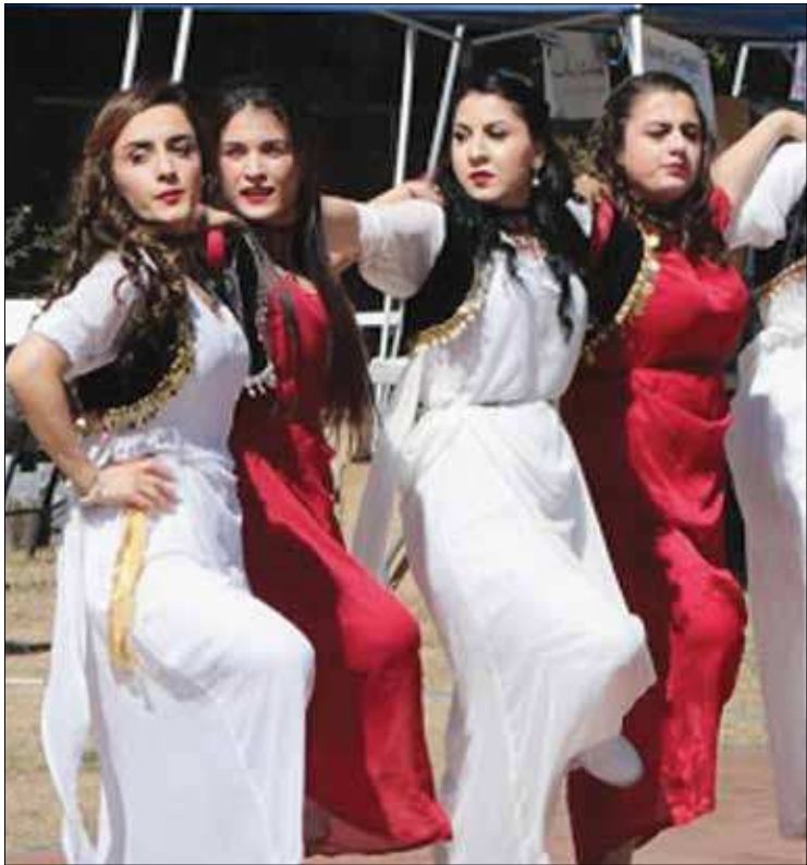
The Delale Dance Group performs a traditional Kurdish dance at last year's Arab Festival in Portland. The annual celebration will return on Saturday, Sept. 1 at Oaks Park.