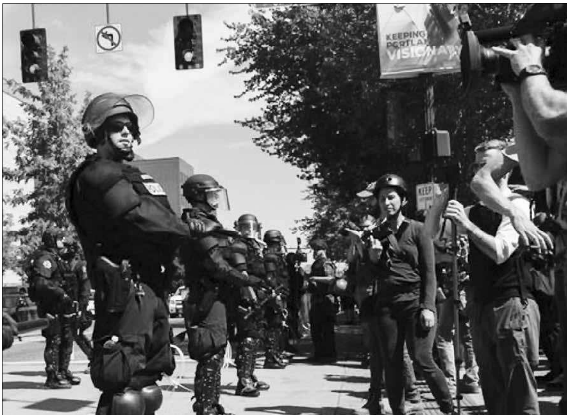
Portland police keep Patriot Prayer affiliates separate from antifa protesters during a rally in Portland, Saturday.