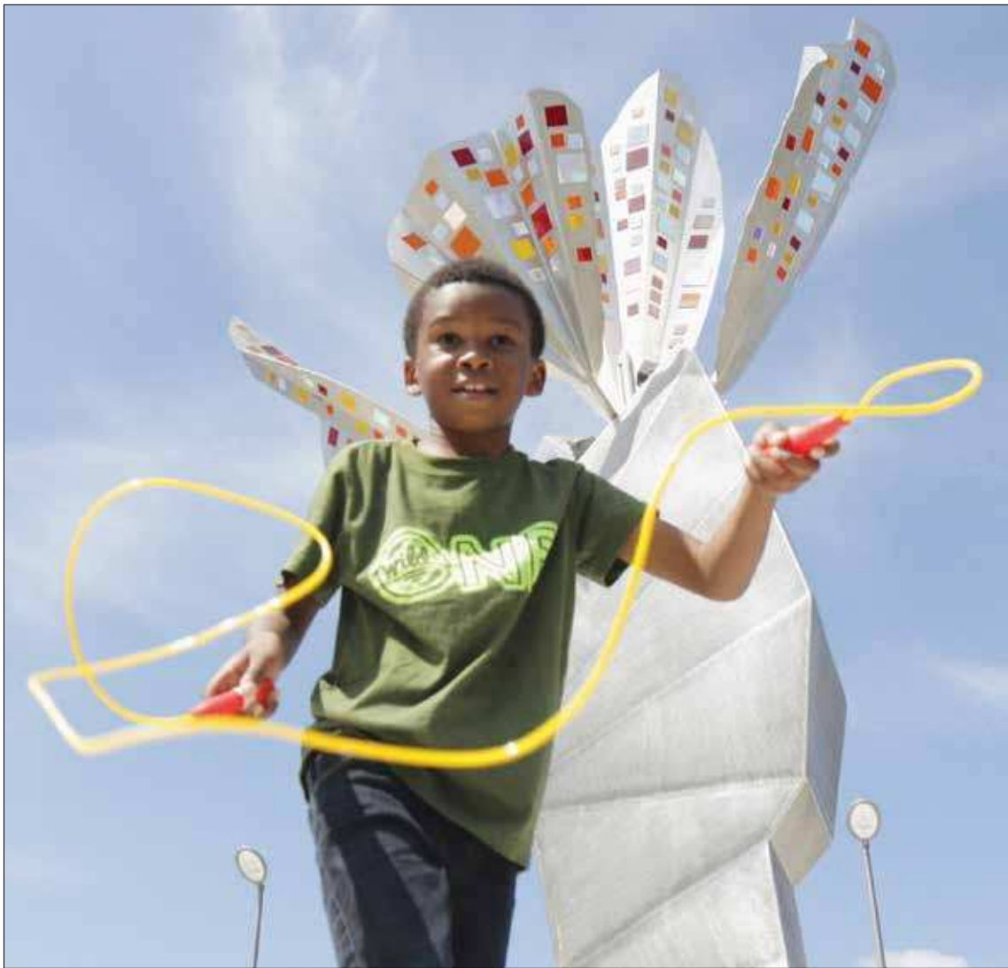
BY DANNY PETERSON/THE PORTLAND OBSERVER