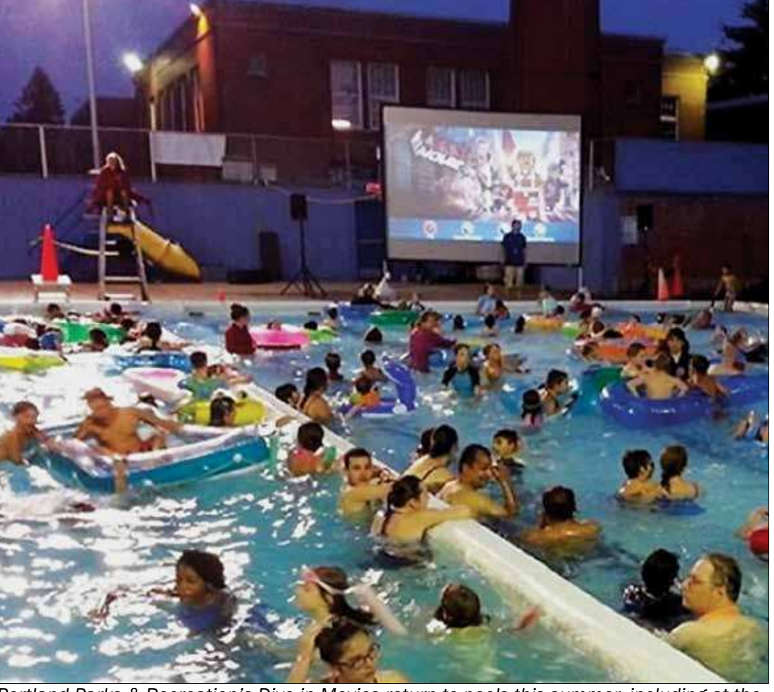
Portland Parks & Recreation's Dive-in Movies return to pools this summer, including at the Grant Park pool (pictured) in northeast Portland.

Advertise with diversity in The Portland Observer Call 503-288-0033 or email ads@portlandobserver.com