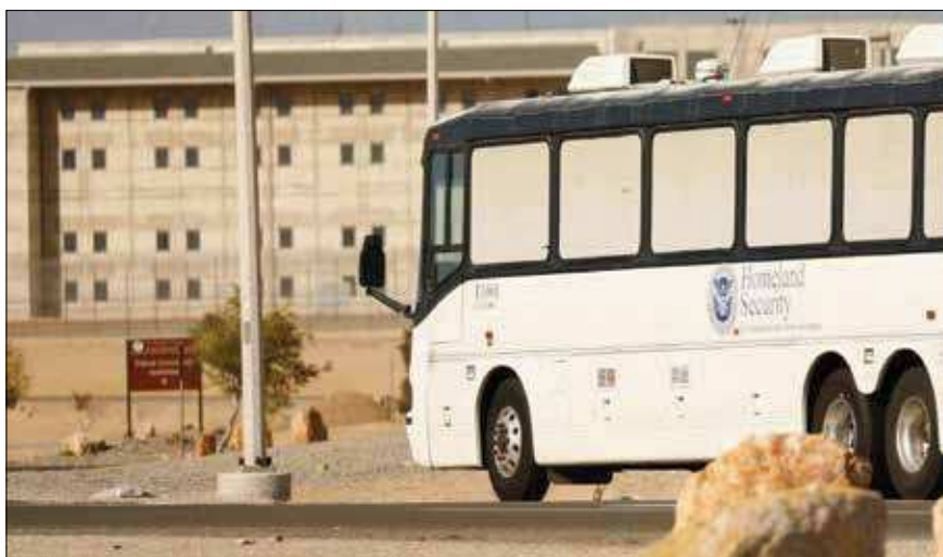
A homeland security bus carries detained asylum seekers to a federal prison in California. Immigrants swept up by President Trump's "zero tolerance" immigration policy at the U.S. -Mexico border have also been sent to the federal prison in Sheridan, Ore. where conditions have been described as intolerable.